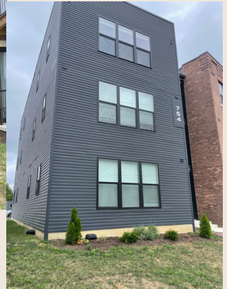
SHILOH BAPTIST CHURCH - COMMUNITY HOUSING PROJECT From Dream to Reality In Partnership with the Kent Fund