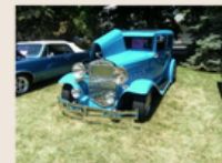
FELLOWSHIP & WINNERS