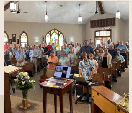
First Baptist Church of St Paris Celebrates their 150th anniversary